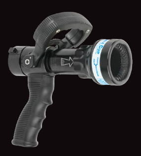
TFT Bubble Cup