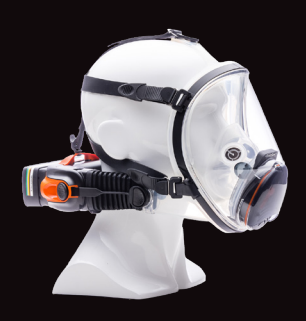
CleanSpace Ultra Full-Face Mask