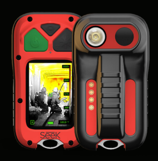
Seek Thermal FirePRO 300