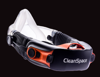
CleanSpace Ultra Half-Face Mask