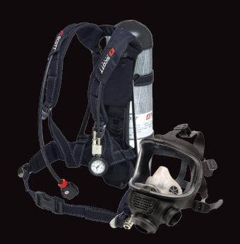
Scott Safety ProPak