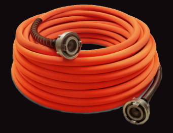
OSW Syntex Monoflex