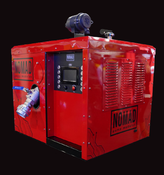
Nomad P5Xd Single Stage Diesel Fire Pump Module