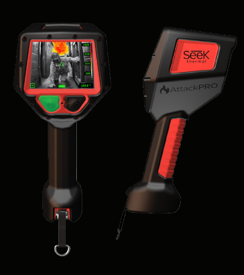
Seek Thermal AttackPRO VRS