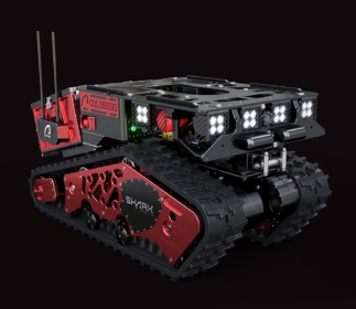
Shark Robotics Colossus