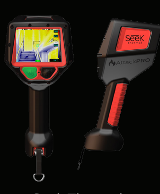
Seek Thermal AttackPRO NFPA