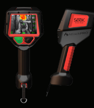
Seek Thermal AttackPRO