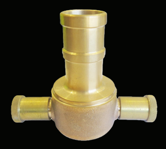
Brass and Alloy BIC Coupling Set