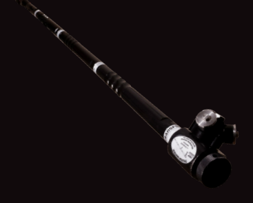
TFT EV Transformer Nozzle