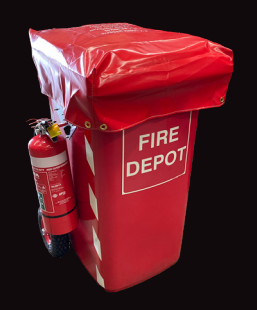
FRSA Fire Depot Kit