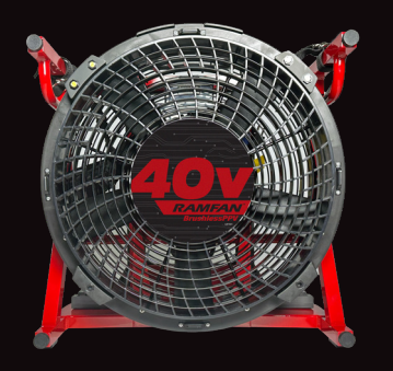
EX50Li DeWalt Milwaukee Makita