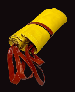
Bridgehill Training Car Blanket