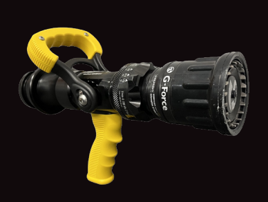
TFT G Force