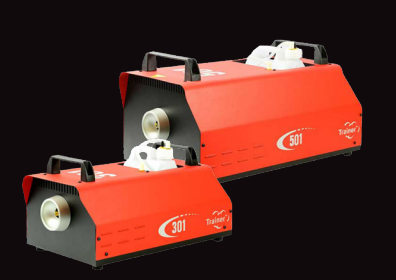
Trainer 301 Smoke Machine