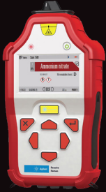
Resolve Standard Package