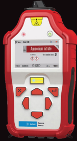
Resolve Chemicals Package