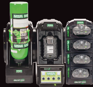
Galaxy GX2 Test Station