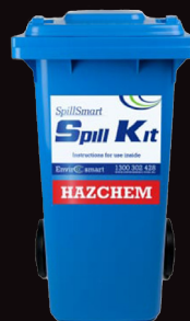
HAZCHEM 120L Kit