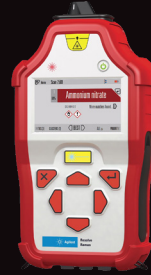
Resolve Comprehensive Package