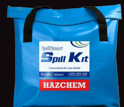
HAZCHEM 80L Kit