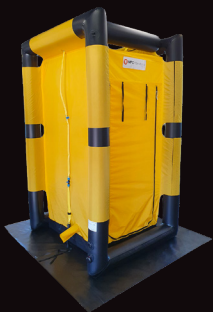
MFC Single Decon Shower