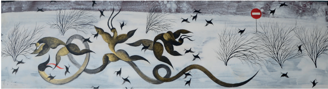
Performers | 2022 | Mixed media on cardboard | 23 x 90 cm | 18.000.000 T