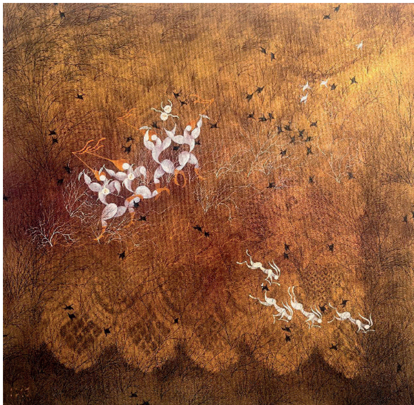
The last Scene | 2022 | crylic on canvas | 70 x 70 cm | 30.000.000 T