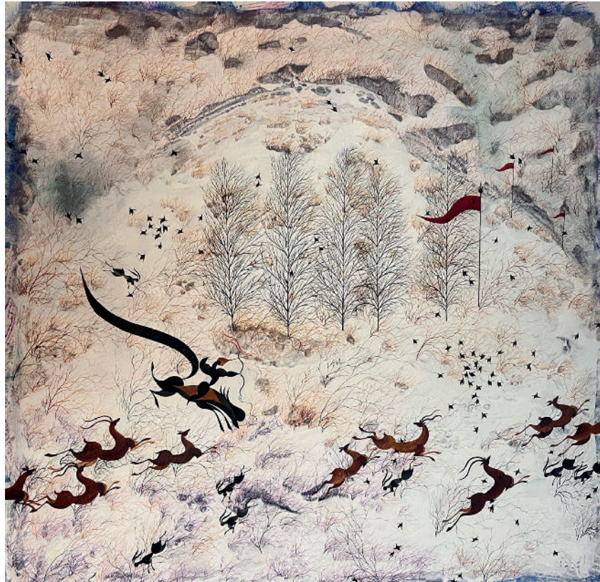
The hunt | 2022 | Acrylic on canvas | 120 x 120 cm | 70.000.000 T