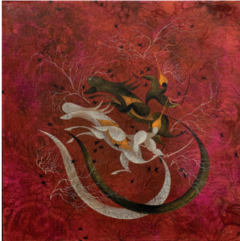
Companions | 2022 | Acrylic on canvas | 50 x 50 cm | 20.000.000 T