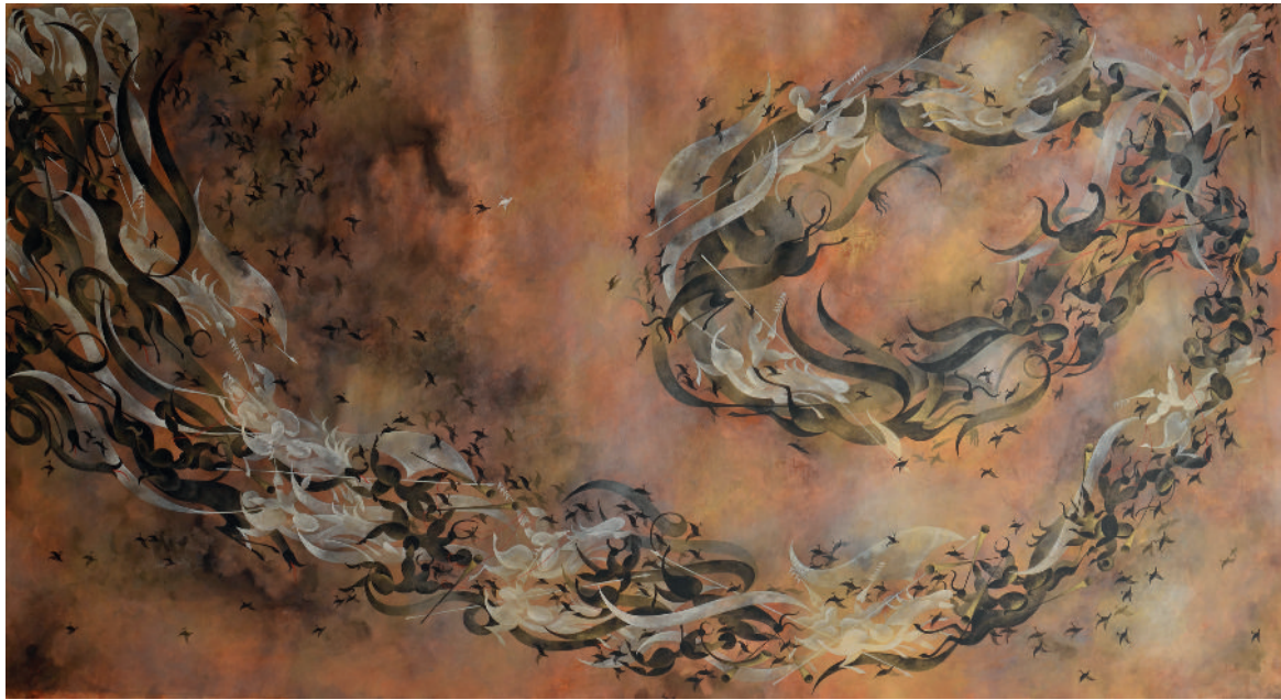
Devil year | 2023 | Acrylic on canvas | 150 x 300 cm | 250.000.000 T