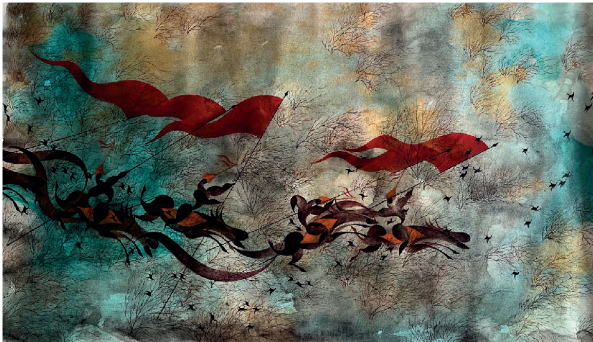
Lost Cavaliers | 2022 | Acrylic on Canvas | 120 x 70 cm | 35.000.000 T