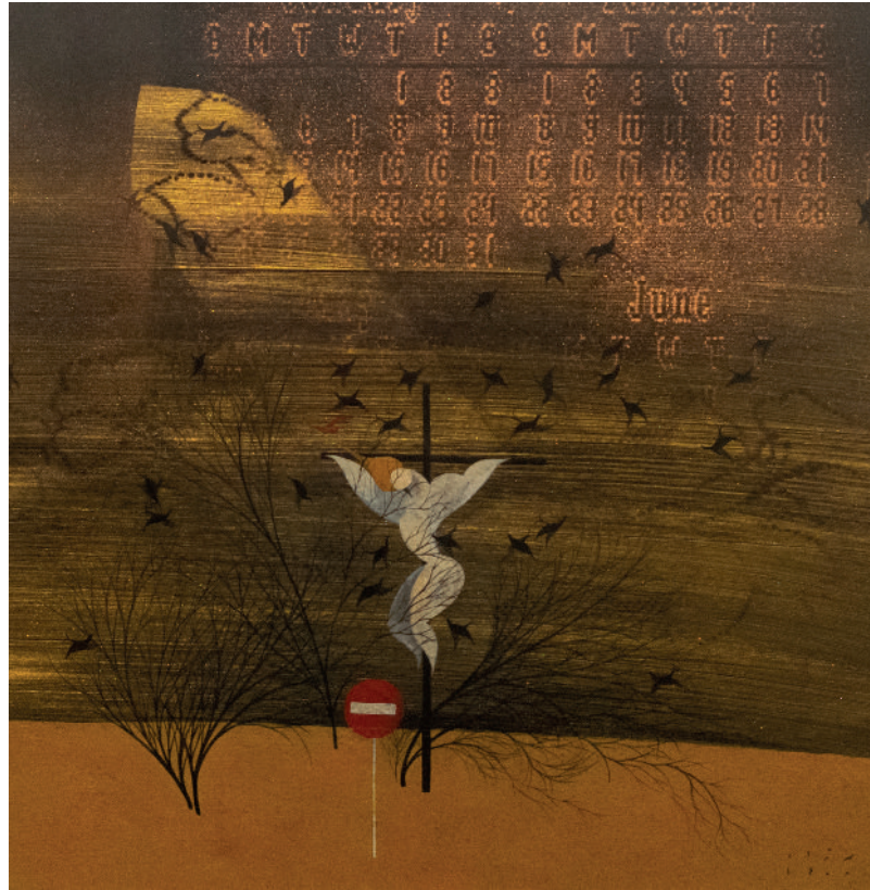
Untitled | 2022 | Mixed media on cardboard | 42 x 43 cm | 15.000.000 T