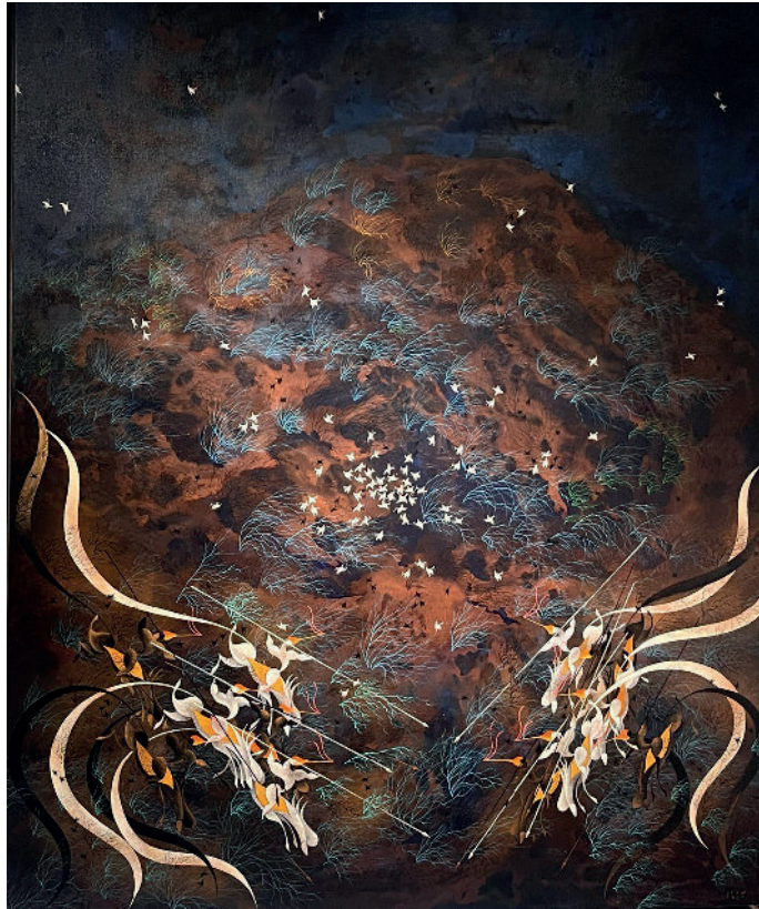
Shadow Dancers | 2022 | Acrylic on canvas | 180 x 150 cm | 140.000.000 T