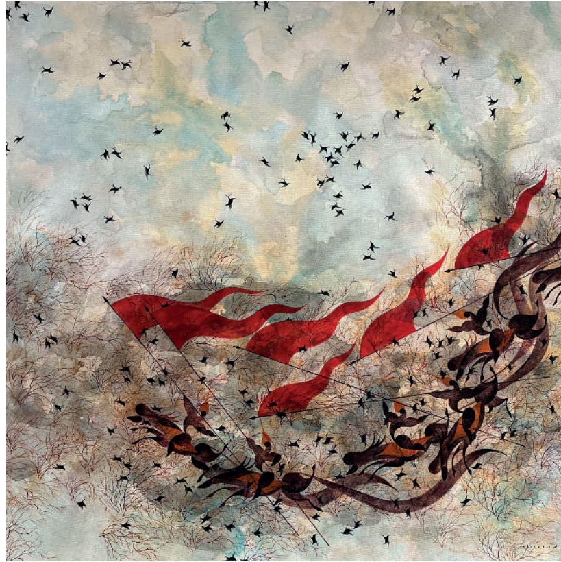
Victorious Cavaliers | 2022 | Acrylic on canvas | 100 x 100 cm | 50.000.000 T