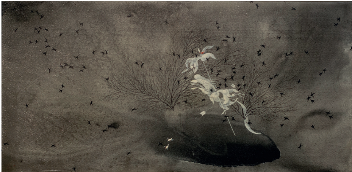
In the garden of souls | 2022 | Acrylic on canvas | 60 x 120 cm | 30.000.000 T