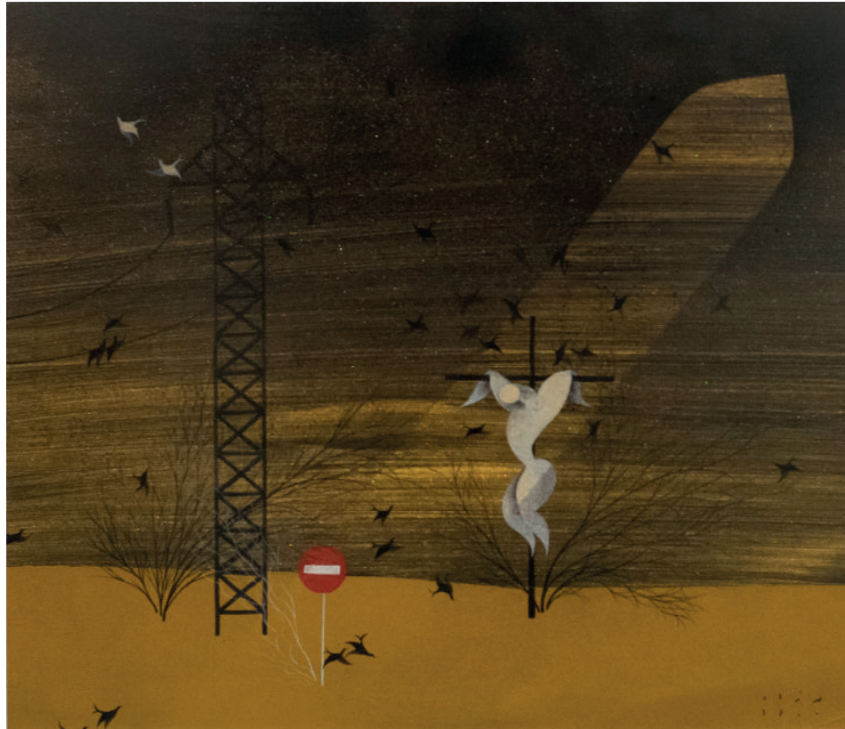
Altar | 2022 | Mixed media on cardboard | 43 x 50 cm | 15.000.000 T