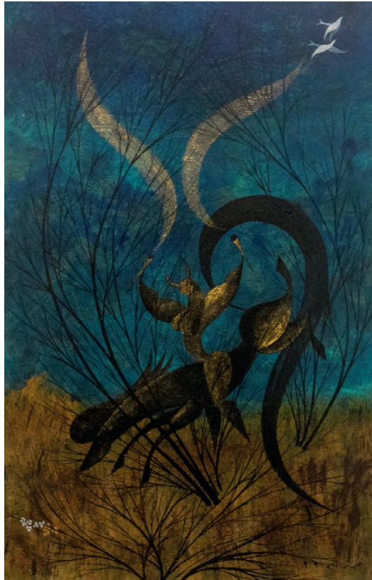
Demon | 2022 | Mixed media on cardboard | 39 x 25 cm | 10.000.000 T