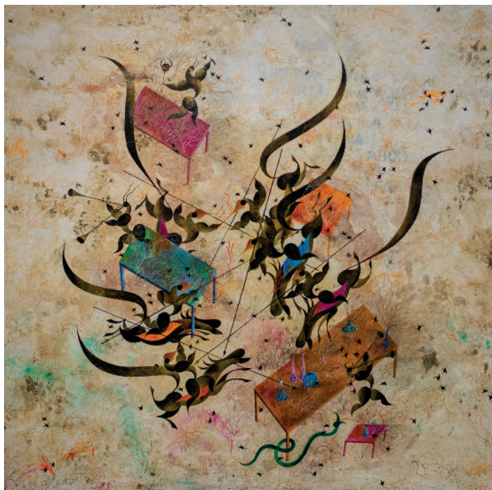
Gathering | 2022 | Acrylic on canvas | 120 x 120 cm | 60.000.000 T