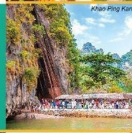
Khao Ping Kan