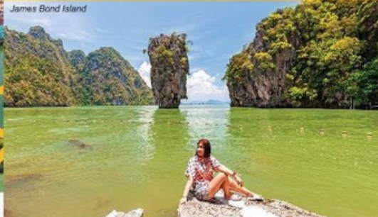
James Bond Island

Notice: The program is not recommend for Pregnant or people who underwent surgery. This program is subject to change without notice depending on sea and weather condition.